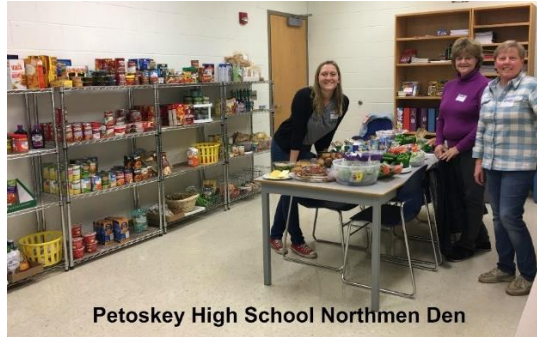
Petoskey High School Northmen Den